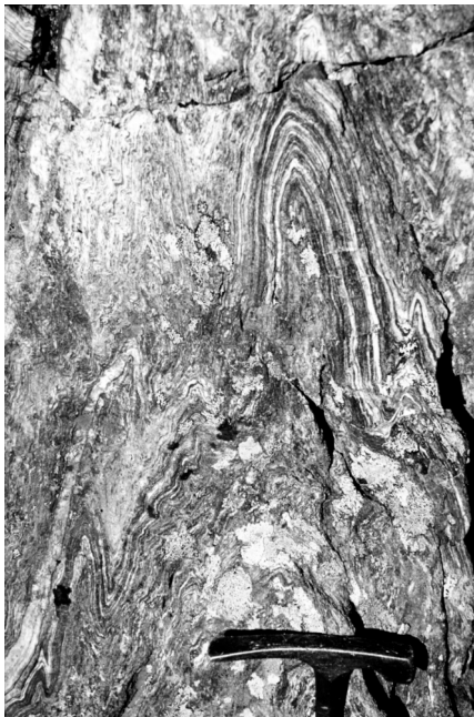
Figure 1: Asymmetric, S- and Z-shaped, parasitic folds in folded, foliated metagabbros, Val Malenco, Southern Swiss Alps.

We use the finite element method to simulate slow viscous (Newtonian) flow in two dimensions without gravity and to model asymmetric (S- and Z-shaped) and symmetric (M-shaped) parasitic folds during multilayer folding. During multilayer folding, the matrix between stiffer layers shows a deformation close to pure shear in the hinge area and a combination of pure and simple shear in the limb areas. Thinner layers placed between thicker layers develop symmetric parasitic folds in the hinge, and eventually asymmetric parasitic folds in the limbs of the larger fold. Our results verify numerically the theory that asymmetric parasitic folds develop from symmetric buckle-folds that are sheared by the hingeward relative displacement of the thick layers in the limbs of the first-order fold. To develop asymmetric shapes, the amplitudes of the parasitic folds must exceed a critical value before the first-order fold begins to amplify. Otherwise the parasitic folds are unfolded during flattening that takes place in the limb area between the thick layers. More than five thin layers are necessary to generate distinct asymmetric parasitic folds for the applied model setting. More layers generate higher amplification rates in the thin layers and, hence, higher amplitudes.